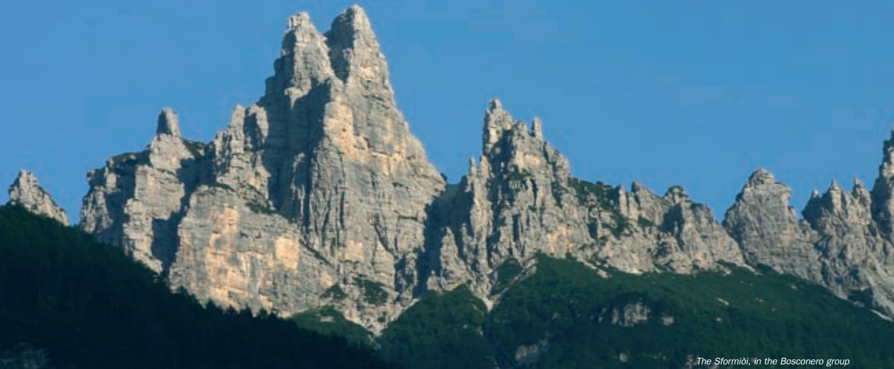
The Sformiò, in the Bosconero group

At 1873m, in the Pian d'Angiàs area, there is an important crossroads. Path n.483, which we have followed up to here, goes off to the left (east) towards the Sassolungo di Cibiàna ; n.485 continues to the right (south-west) towards the Bivacco Darè Copàda and beyond, while towards the south east go paths n.482 and 485, together until Al Crònf, 1789m, well beyond the Forcella de le Ciavazòle and under the Cima Nord (north peak) dei Sformiò .