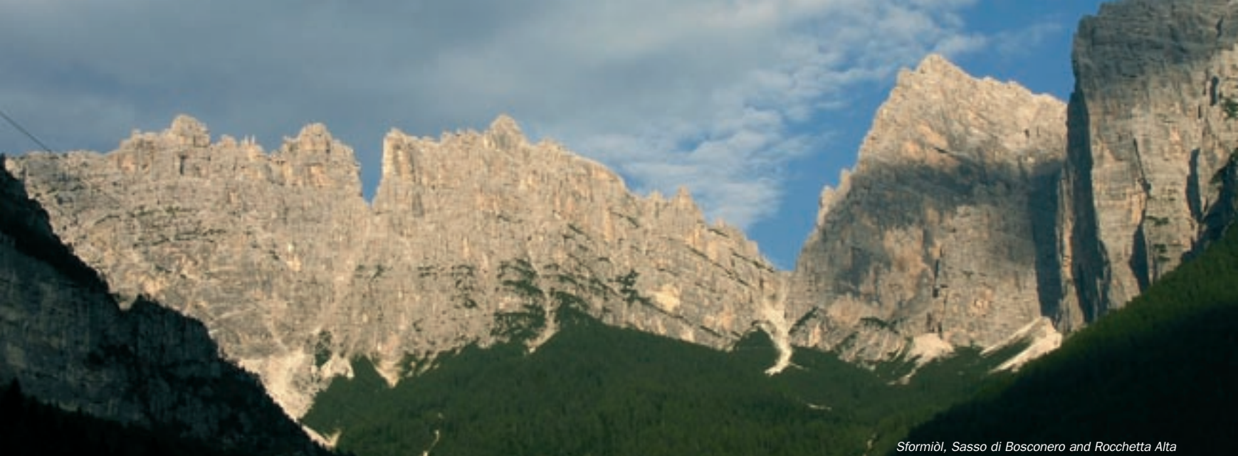
Sformiòl, Sasso di Bosconero and Rocchetta Alta

It might be a good idea to end Day Five here. It would give you the chance to visit the Museum properly and enjoy – weather permitting – a truly memorable, unparalleled sunset and sunrise. Since the following day's route is short, there is no reason why you should miss out on this opportunity.