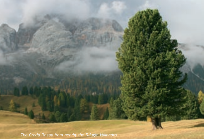
The Croda Rossa from nearby the Rifugio Vallandro