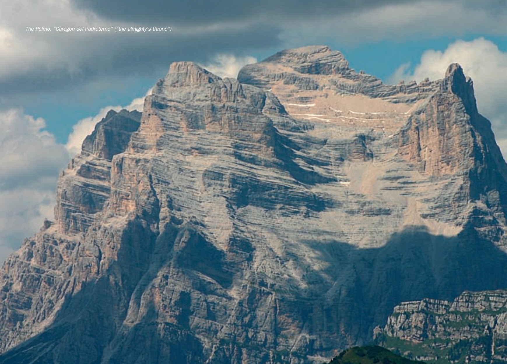
The Pelmo, "Caregon del Padreterno" ("the almighty's throne")