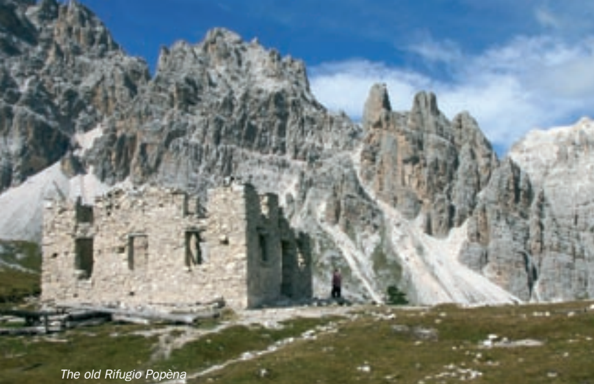
The old Rifugio Popèna

From Ponte Val Popèna Alta , take the mule-track n. 222 which goes south along the Rio Popèna and goes right up the Val Popèna Alta to the Forcella di Popèna , 2214m, a large saddle between the Corno d'Angolo and the Pale di Misurina .