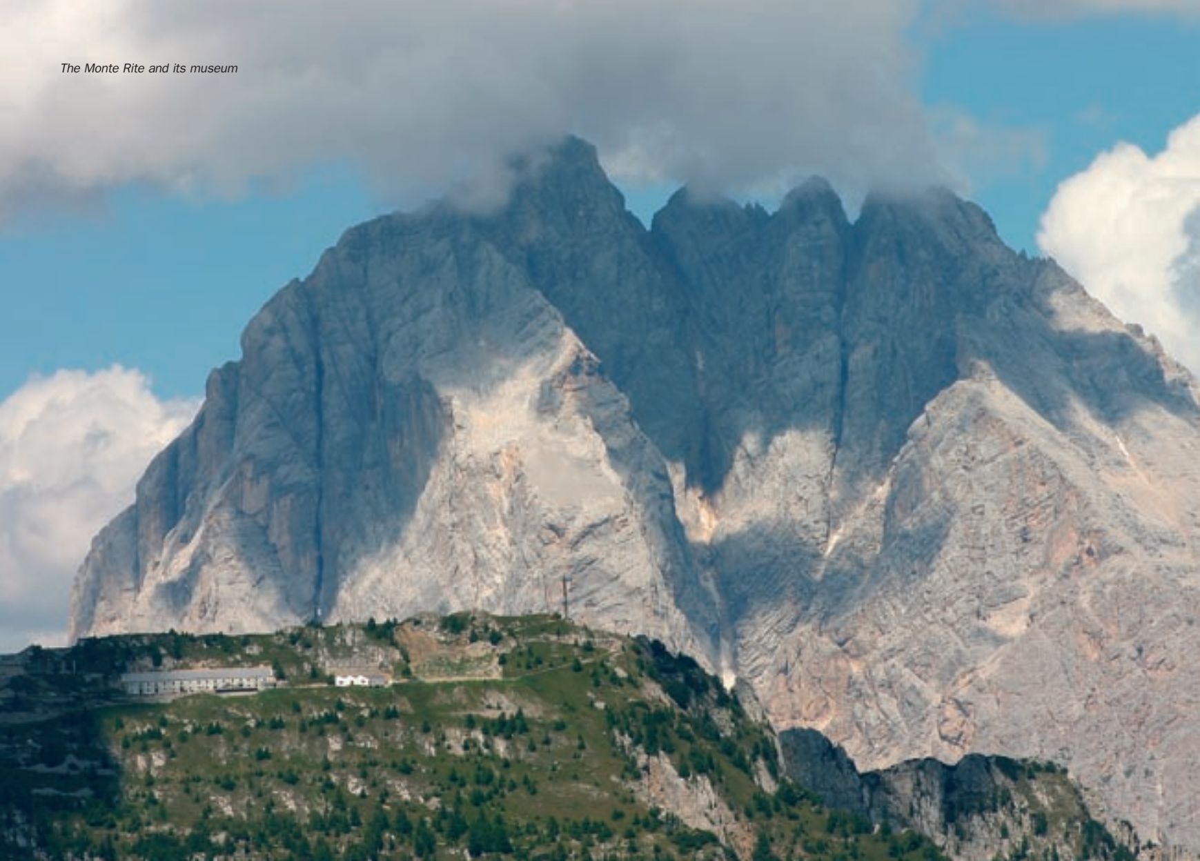
The Monte Rite and its museum