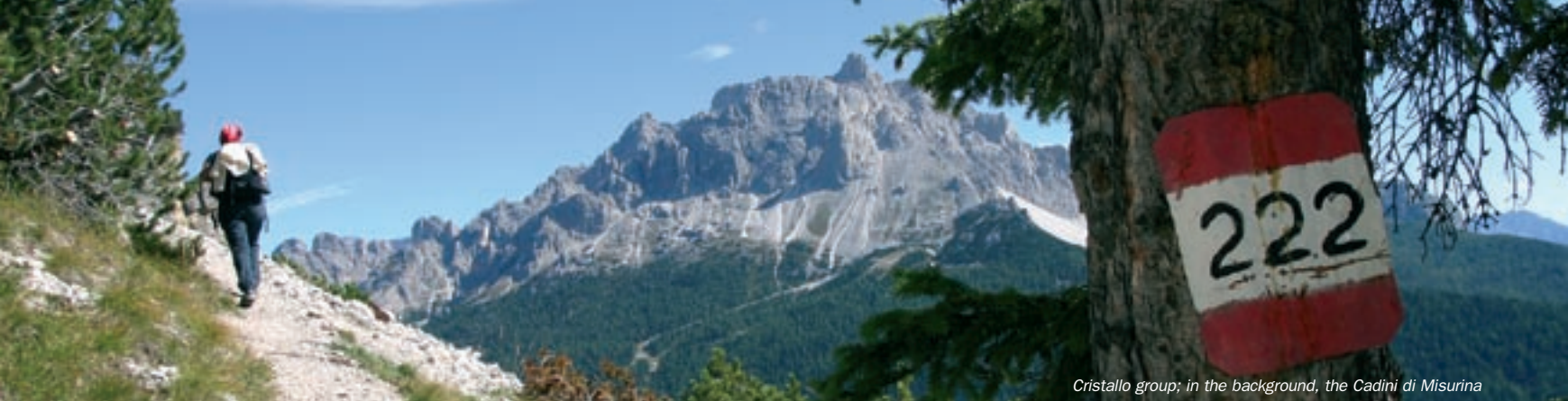
Cristallo group; in the background, the Cadini di Misurina

The best thing to do in order to avoid walking in the thick of the traffic for 15km (from the Hotel Tre Cime di Lavaredo ) or 12km (from Carbonin ), is to get a taxi or some other vehicle from the Hotel Tre Cime di Lavaredo or from Carbonin to take you to Misurina , 1756m (where there is plenty of choice of food and accommodation), and then on to the Passo Tre Croci (refreshment), 1808m.