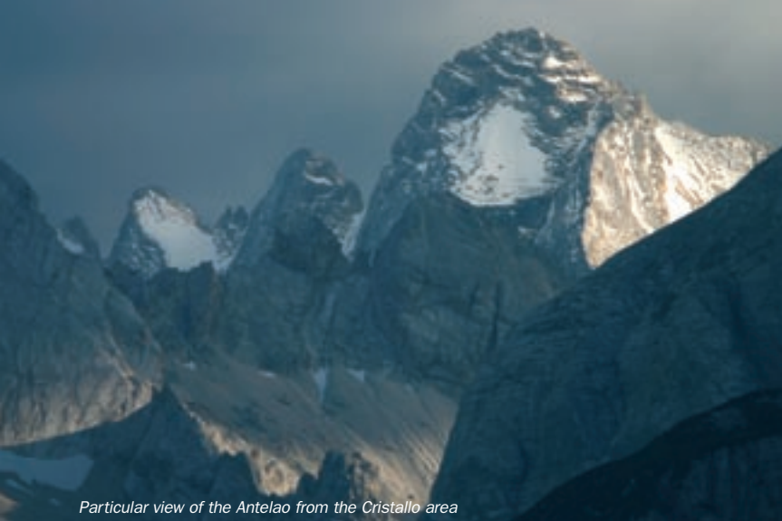
Particular view of the Antelao from the Cristallo area

The Rifugio Tondi , privately owned, offers basic hotel services with typical local cooking. 8 beds, mains electricity, hot water and shower. Tel: 0436 5775